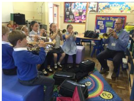
Children enjoying Dorset Music Service brass lessons.

Swimming has started in school and the children are enjoying their daily (warm!) swims and the refurbished changing rooms. Thank you to the TSA for cleaning the pool area and raising a huge amount of more than £700 from the sponsored Splashathon . Many children from Bredy and Eggardon took part in the Swimming Gala at the Bridport Leisure Centre and did the school proud. Excellent work!