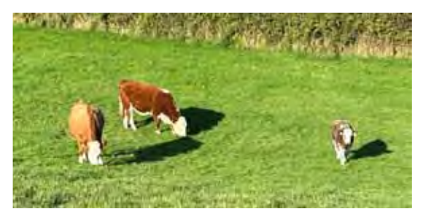
"Meg you left one behind!"

Rain Rain and more rain perhaps we should sell all livestock, etc and plant watercress or rice!!! But seriously, some of our cows winter out at the top of the farm and the calves seem to be enjoying playing in the dew pond which is already overflowing.